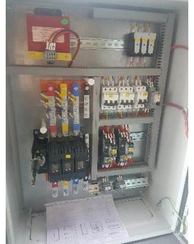
> 15 Nos. Starter Panels