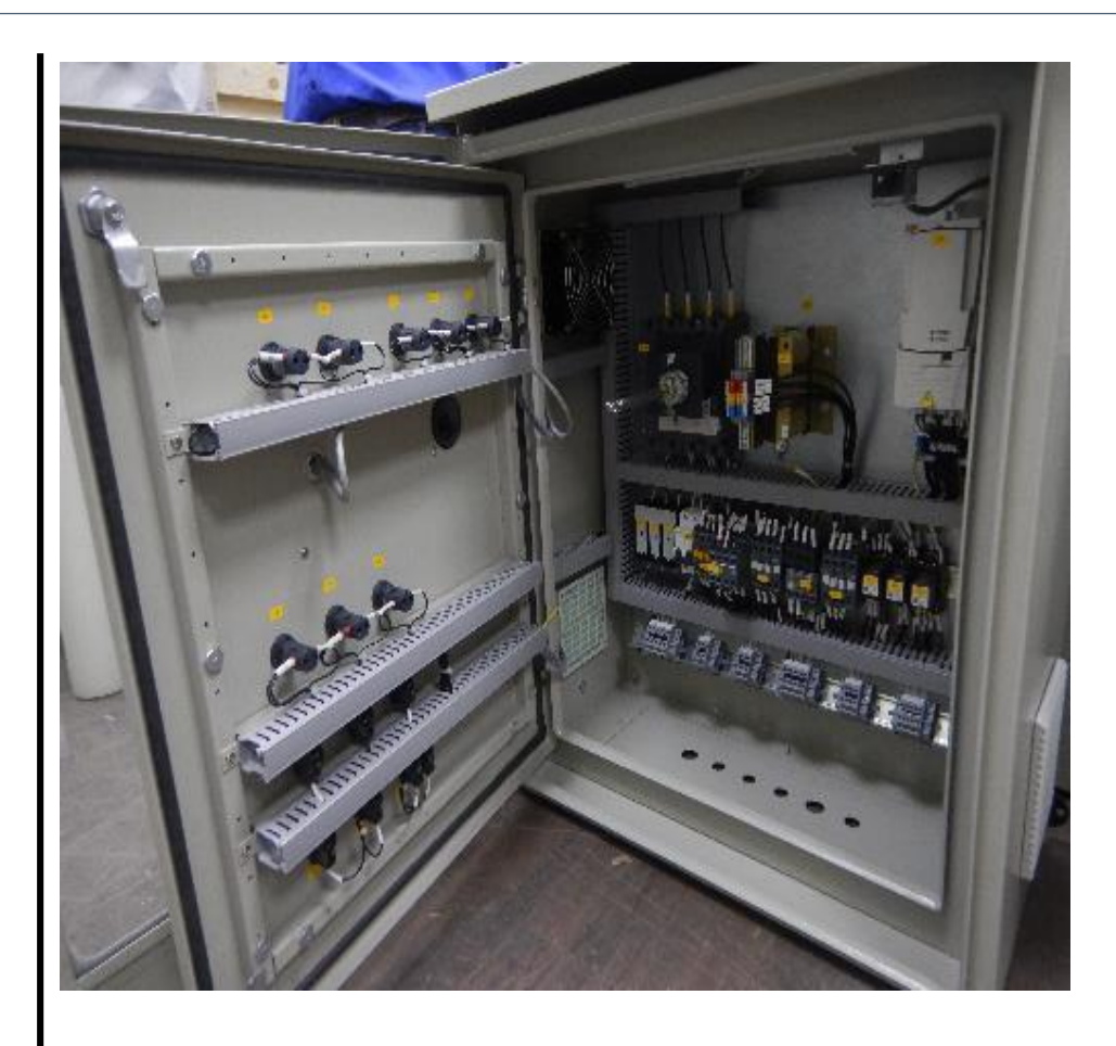
- VFD with DOL Bypass Starter Starter